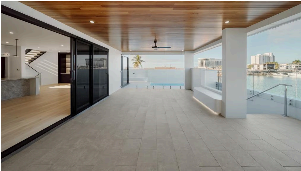
The eight waterfront homes are located in Breakwater Marina, and were developed by Maidment Group.