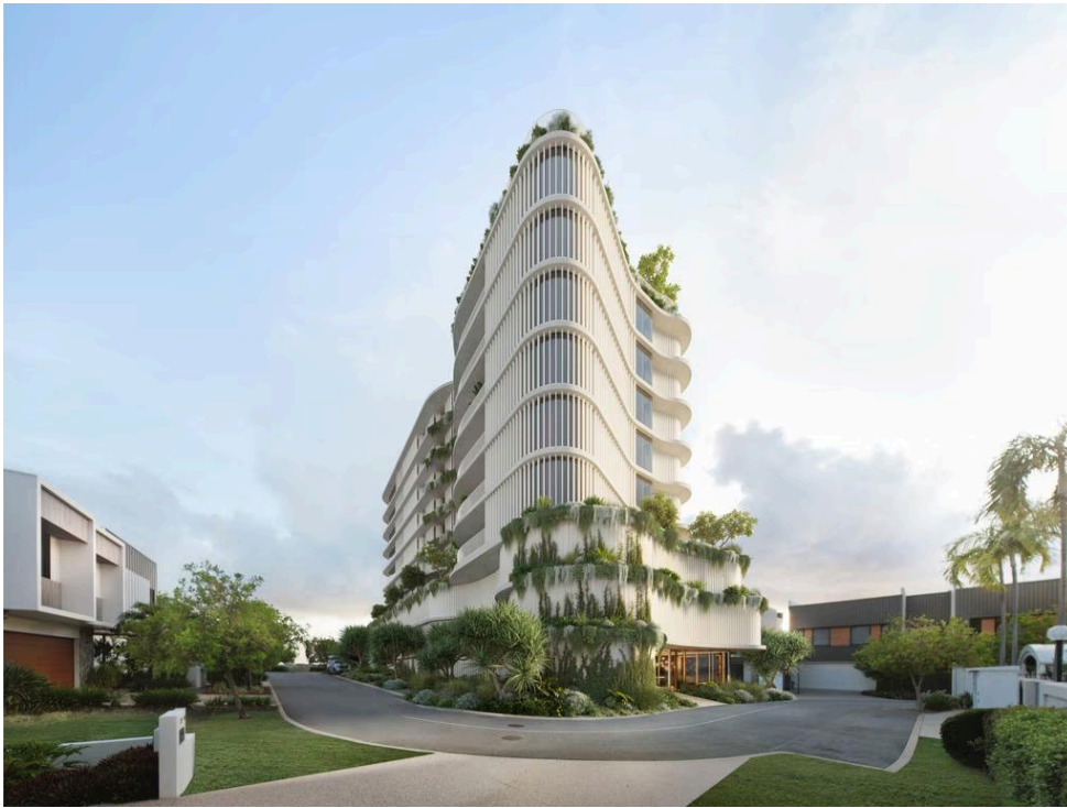
Artwork of the apartment complex at Marina Residences by Maidment Group. Construction is expected to begin in early 2025.

The builder for the apartment is listed as Hurst Constructions.