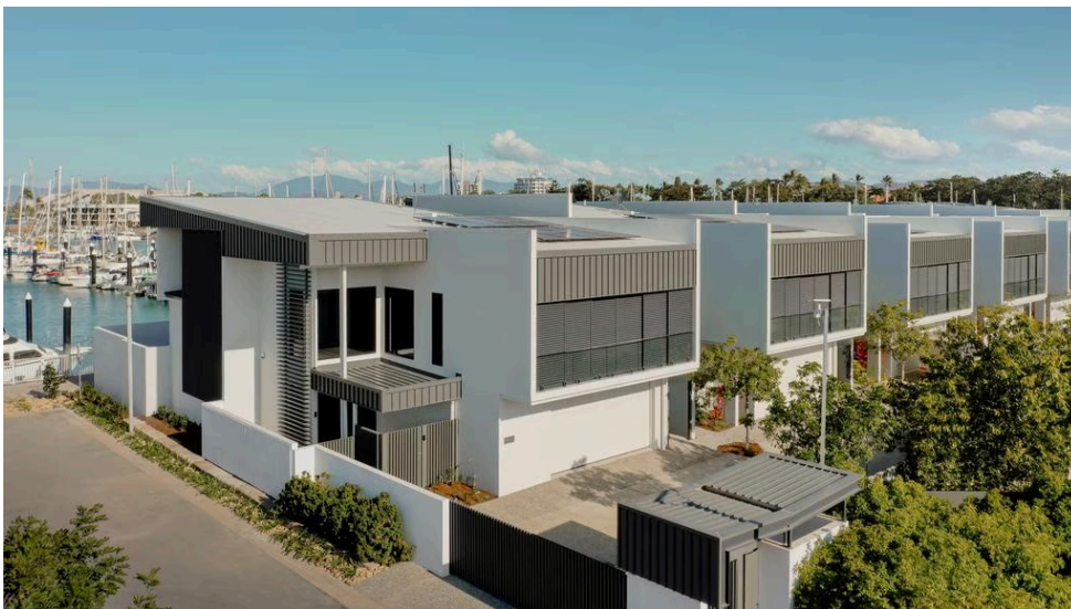
The eight waterfront homes are located in Breakwater Marina, and were developed by Maidment Group.

Their features include private plunge pools, lifts, private gateway laneway access, high-quality finishes and more.