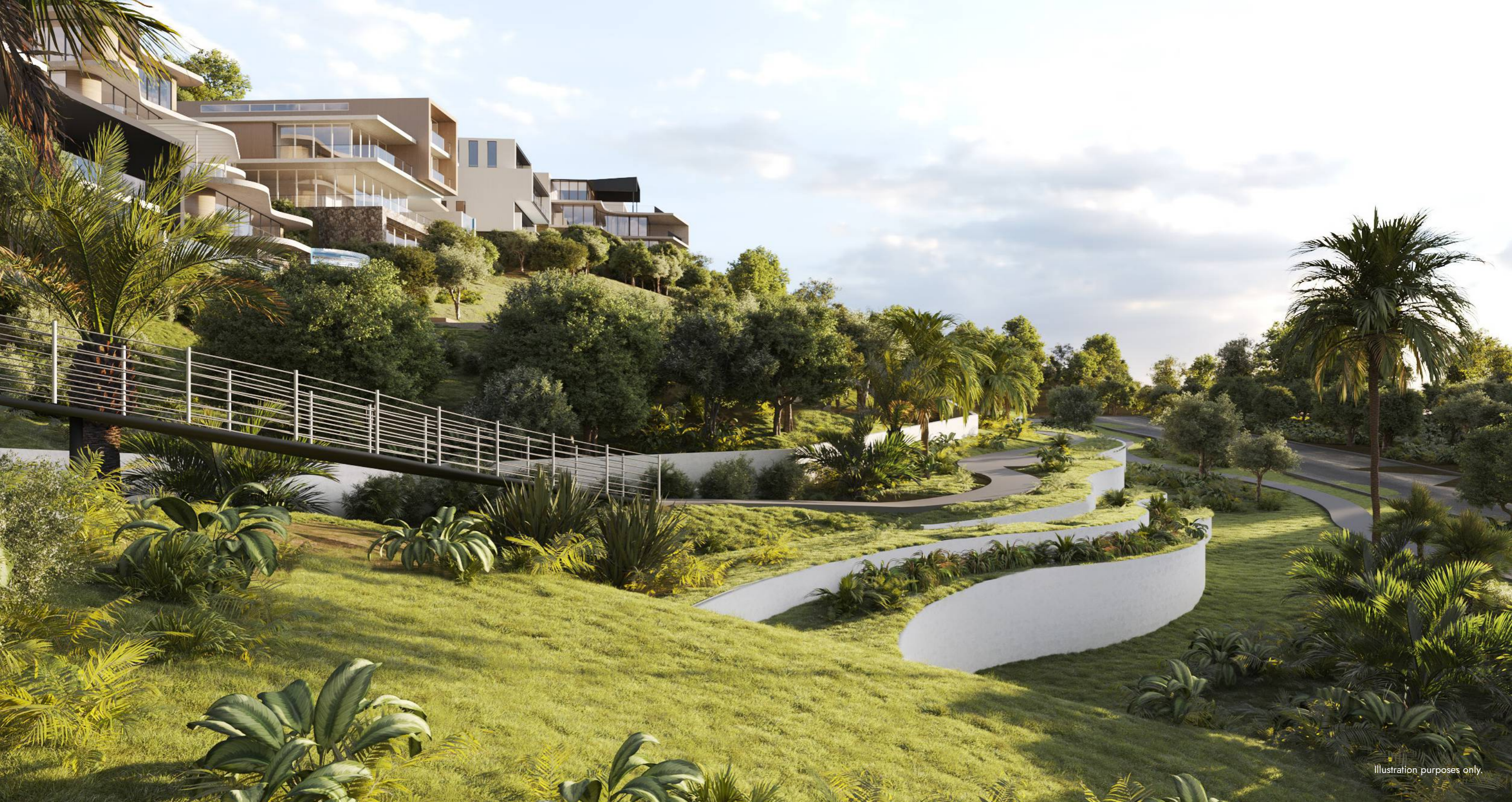
Illustration purposes only.