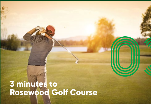
3 minutes to Rosewood Golf Course