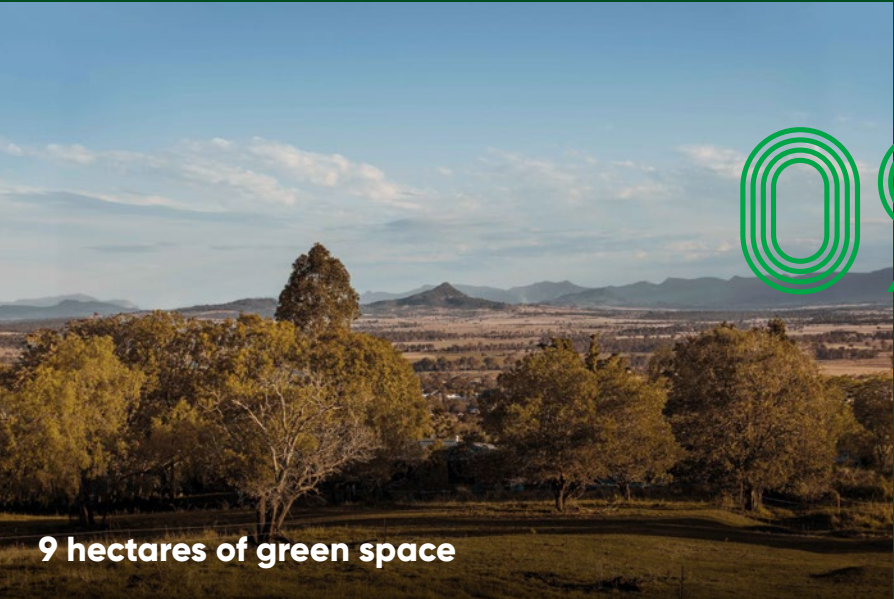
9 hectares of green space