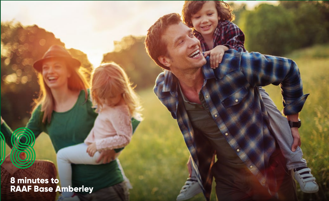
8 minutes to RAAF Base Amberley