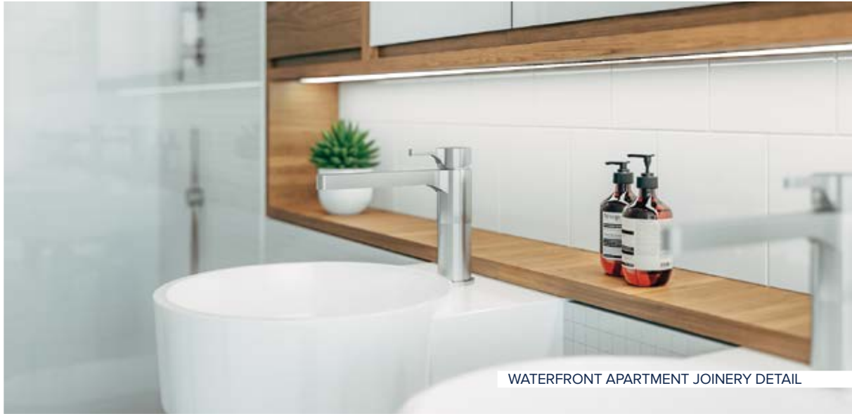
WATERFRONT APARTMENT JOINERY DETAIL