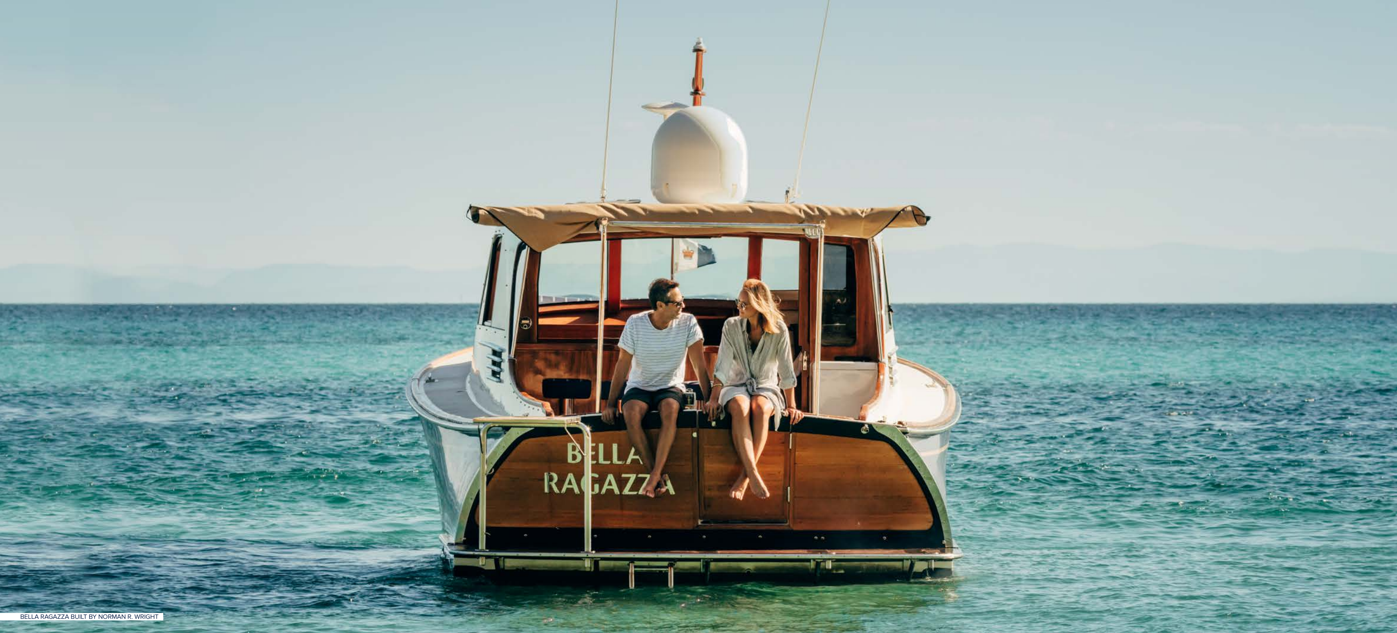
BELLA RAGAZZA BUILT BY NORMAN R. WRIGHT