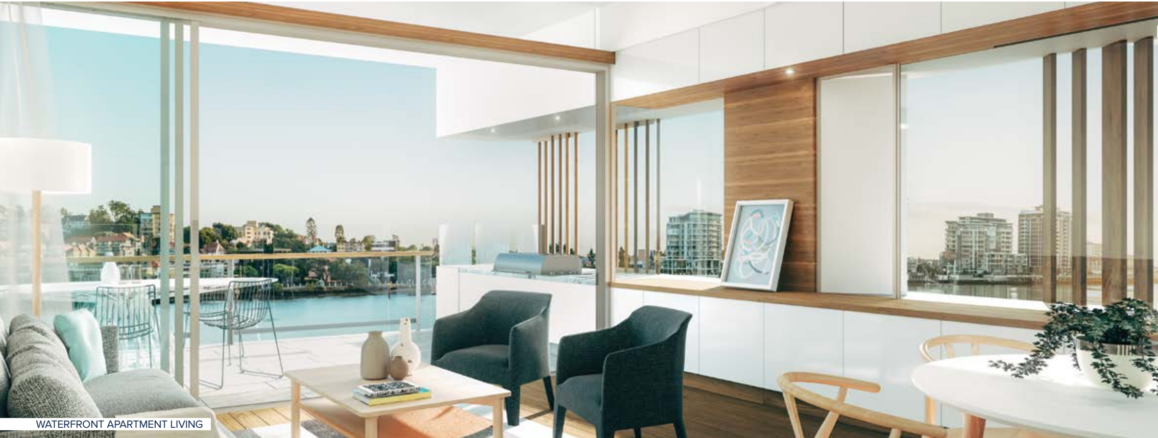
WATERFRONT APARTMENT LIVING

The Boatyard Waterfront apartment residents will also enjoy the added luxury of a fully integrated Liebherr fridge/freezer, perfection in wine storage with an under bench Liebherr wine fridge and the unsurpassed quality of Miele laundry appliances.