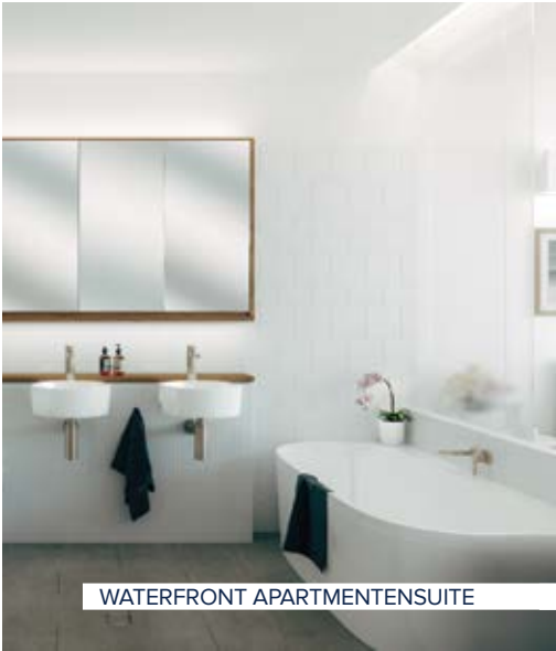
WATERFRONT APARTMENT SUITE