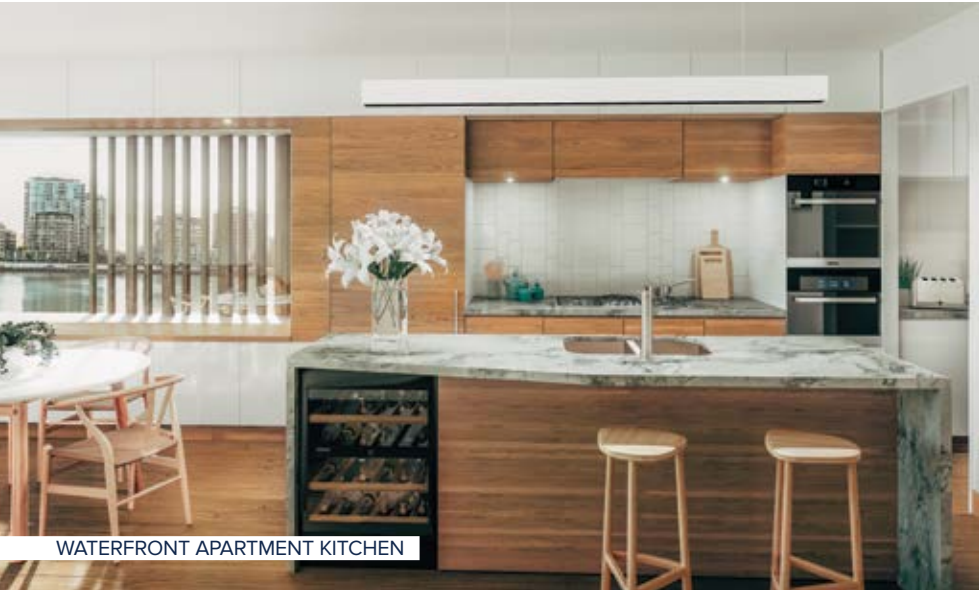
WATERFRONT APARTMENT KITCHEN