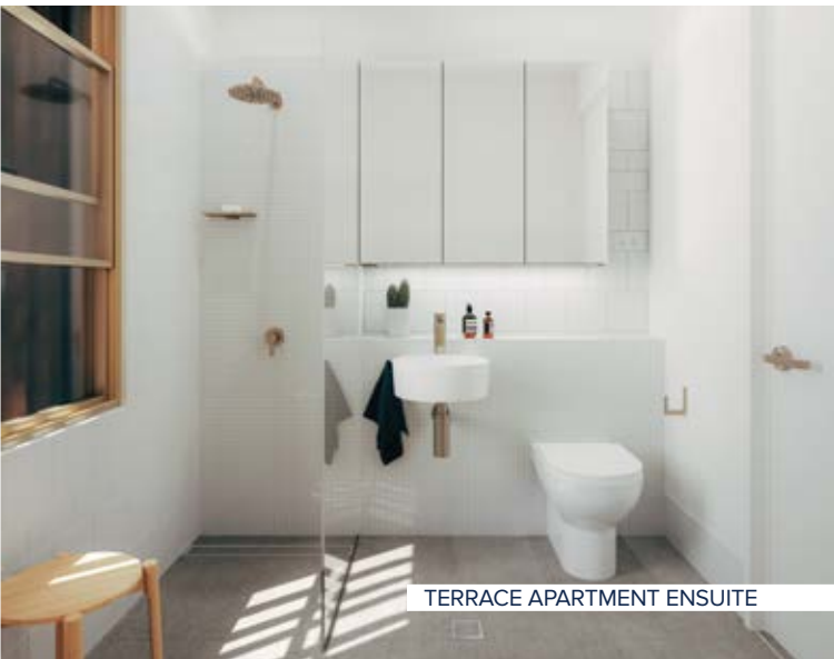
TERRACE APARTMENT ENSUITE