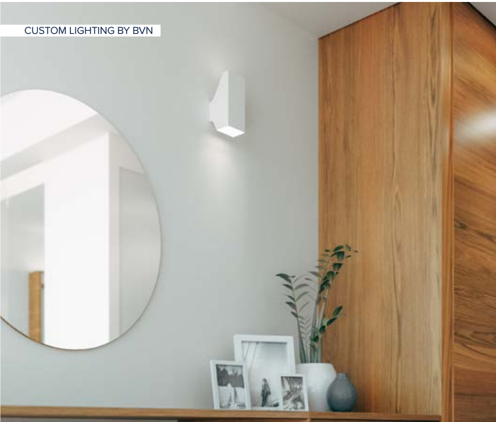
CUSTOM LIGHTING BY BVN