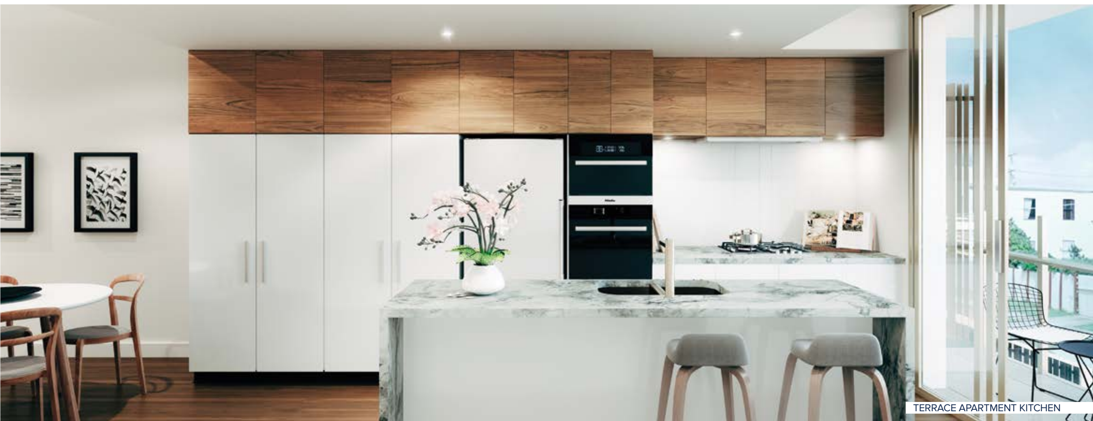
TERRACE APARTMENT KITCHEN

Like the spectacular boats crafted on this very site, The Boatyard's apartments will be fitted with materials selected for their form, function and enduring beauty. Hand picked timber, polished stainless steel and naturally beautiful stone surfaces blend with crisp white to create a mood of unaffected luxury.