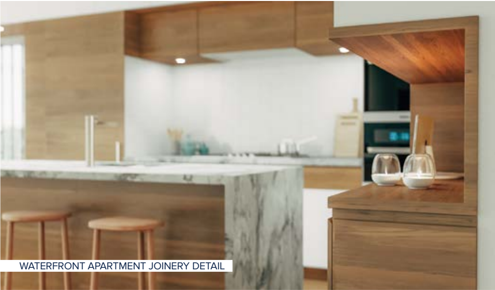
WATERFRONT APARTMENT JOINERY DETAIL