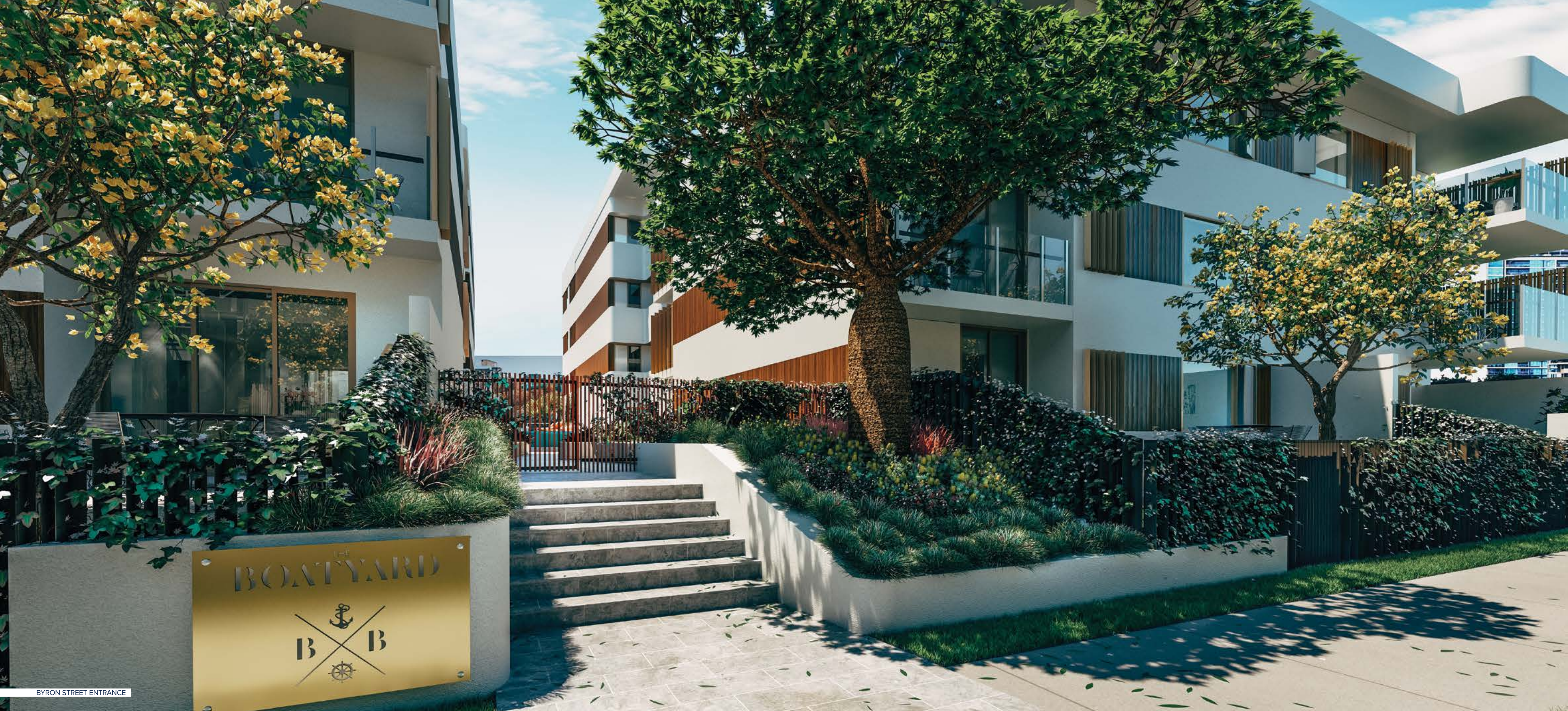
BYRON STREET ENTRANCE