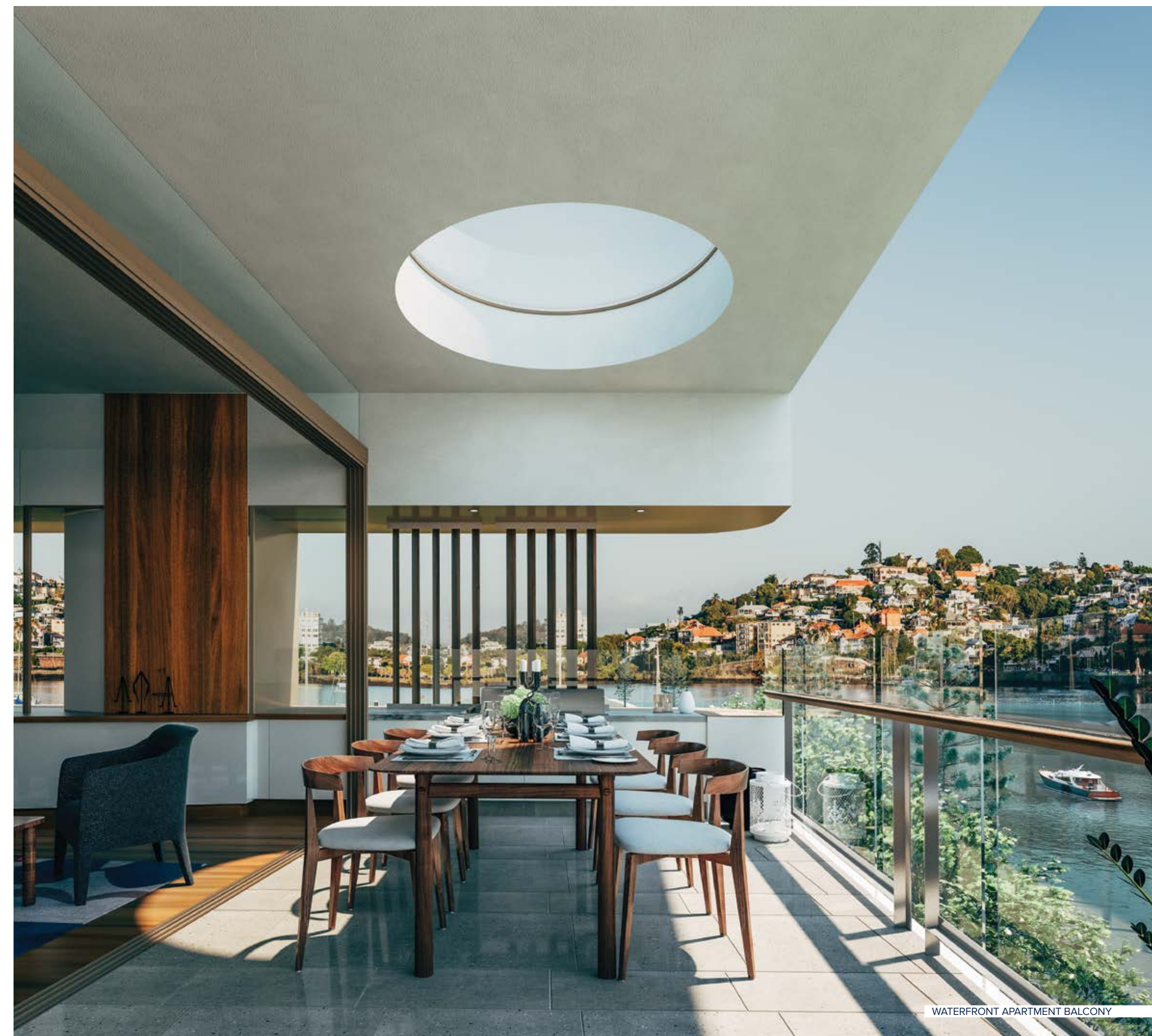
WATERFRONT APARTMENT BALCONY

Welcome to The Boatyard Bulimba. Waterfront living without equal for those that seek the very best life has to offer.